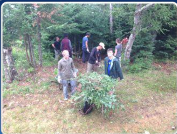
Caption: The Voyageur Outward Bound Adventure School from Ely, Minnesota participated in several cleanup activities during four visits this summer. The group was responsible for clearing ½ an acre of grounds near the guest house to protect from forest fires.