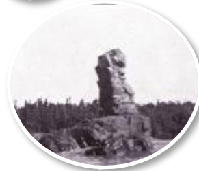
Robert Bell map identified Point Porphyry Island as Kawagaha-Mish

decode the wording, although it was noted that the middle part of the work resembles “-aagam” which refers to a body of water. We are hoping at some point to fully uncover the First Nations name for Porphyry Island to further understand this place where humans have visited for multiple generations. One further aside, on Bell's map, nearby Edward Island is identified as “Shawano Island” and Silver Islet is noted as “Ryanton”. Although full understanding is difficult, Shawano can be translated as “southerner, or people from the south”. We hope that this research will further visitor understanding of previous people's interactions with the landscape and environment of this region.